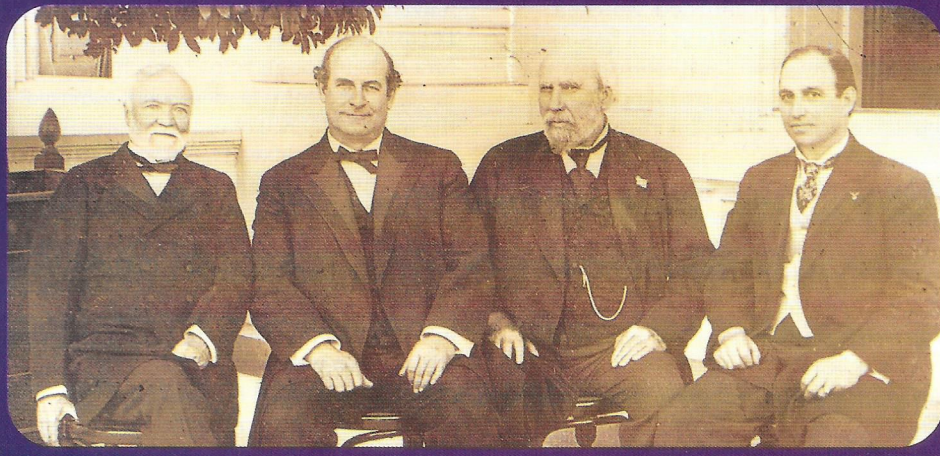
During his career, Mitchell (right) dealt with the country's influential leaders, such as (from left) steel magnate Andrew Carnegie, political evangelist William Jennings Bryan, and railroad titan James J. Hill. The four were photographed in 1905 at a labor conference.

With the Republican Party applying political pressure on the hard coal operators to grant concessions, the miners resumed work on October 29. They had won a ten-percent wage increase, abolition of the sliding scale, and promises from the operators to meet with employee grievances committees. The victory attracted one hundred and twenty-five thousand new union members, giving anthracite workers equal